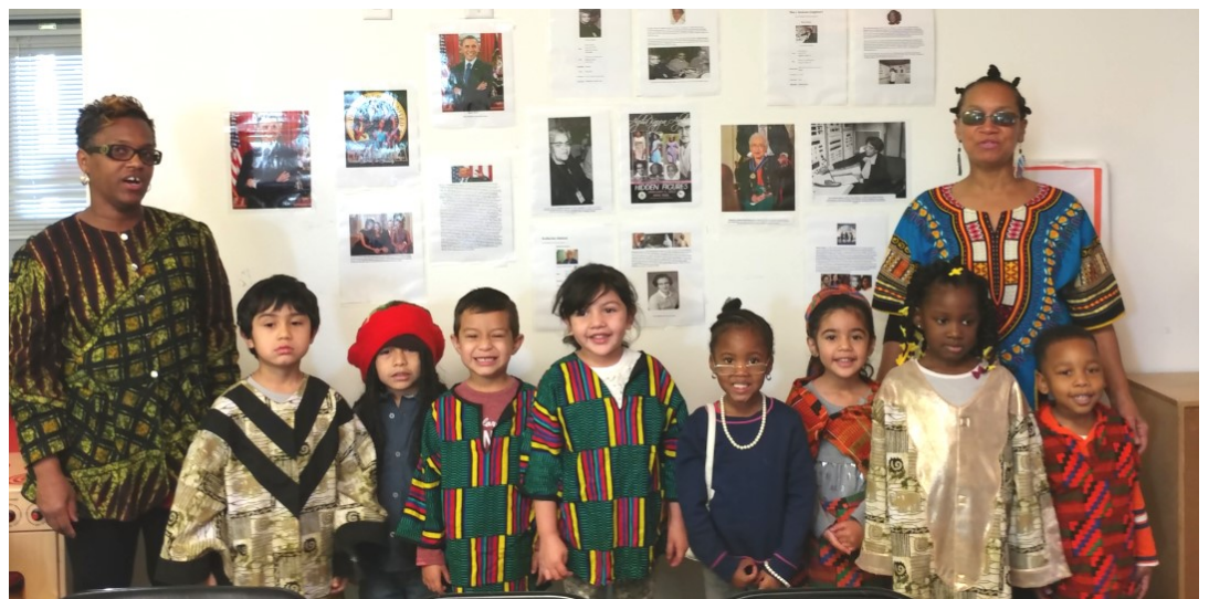
Staff and students looking very regal for their annual Black History Month Celebration.

The Children's Collective Inc. continuously enrolls for Infant, Toddler, Full Day and Part Day Preschool Programs. Call 213-747-4046.