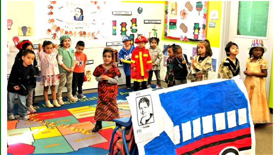
Children present the story of Rosa Parks and her refusal to give up her seat on the bus after working all day.

The children at Casa Dominguez celebrated Black History Month in grand style. The children wore different costumes to depict historical Black American legends from the civil rights movement to professional sports. The classroom was beautifully decorated with historical pictures about the achievements and contributions of many prominent African Americans. There was standing room only for this event.