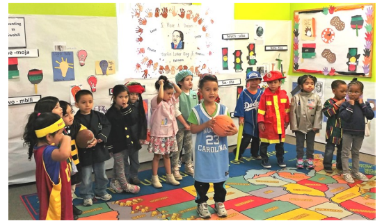
Student presenting as basketball great Michael Jordan.