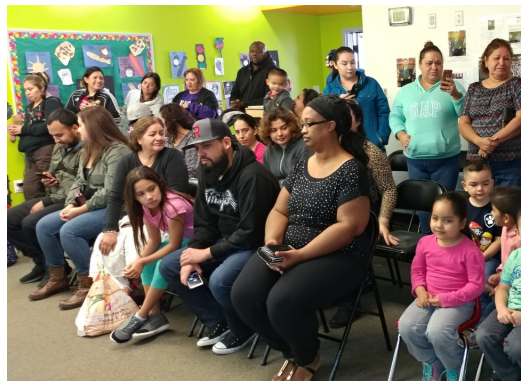
Staff, families and friends cheer for their children.