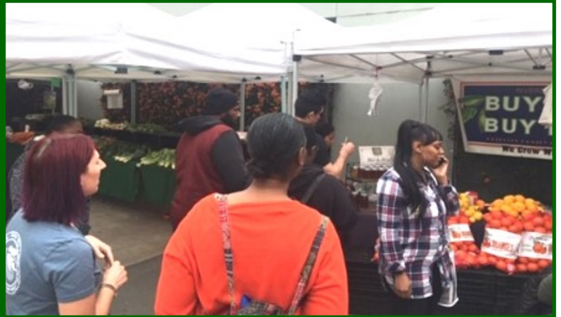
Nutrition-Ed. Class & Food Touring Farmer's Market

The Central Ave. Farmer's Market is located at 4301 S. Central Ave. and runs every Thursday 10am-3pm.