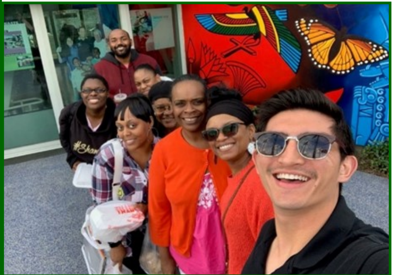
CFC Staff and clients leaving the Farmers Market